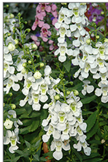
Serena White Angelonia flowers

Serena White Angelonia is a fine choice for the garden, but it is also a good selection for planting in outdoor containers and hanging baskets. With its upright habit of growth, it is best suited for use as a 'thriller' in the 'spiller-thriller-filler' container combination; plant it near the center of the pot, surrounded by smaller plants and those that spill over the edges. Note that when growing plants in outdoor containers and baskets, they may require more frequent waterings than they would in the yard or garden.