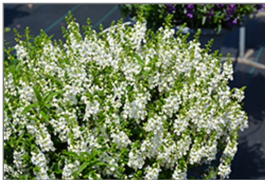
Serena White Angelonia in bloom