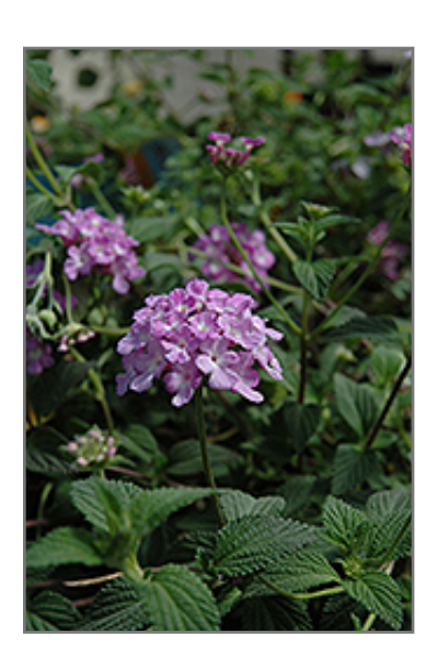
Lavender Swirl Lantana flowers

Lavender Swirl Lantana will grow to be about 12 inches tall at maturity, with a spread of 4 feet. Although it's not a true annual, this fast-growing plant can be expected to behave as an annual in our climate if left outdoors over the winter, usually needing replacement the following year. As such, gardeners should take into consideration that it will perform differently than it would in its native habitat.