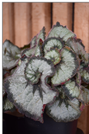
Escargot Begonia foliage