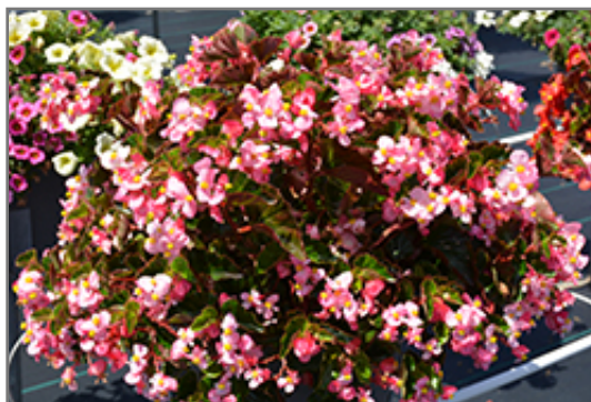
BabyWing Pink Begonia in bloom

BabyWing Pink Begonia will grow to be about 12 inches tall at maturity, with a spread of 12 inches. When grown in masses or used as a bedding plant, individual plants should be spaced approximately 10 inches apart. Its foliage tends to remain dense right to the ground, not requiring facer plants in front. Although it's not a true annual, this plant can be expected to behave as an annual in our climate if left outdoors over the winter, usually needing replacement the following year. As such, gardeners should take into consideration that it will perform differently than it would in its native habitat.