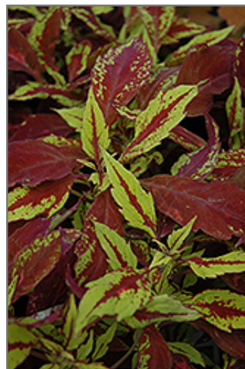
Pineapple Coleus foliage