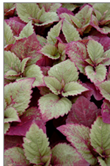
ColorBlaze Royal Glissade Coleus foliage