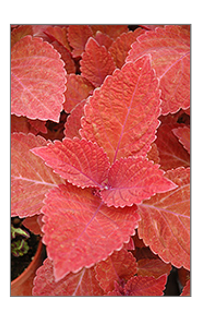
Big Red Judy Coleus foliage

Big Red Judy Coleus will grow to be about 3 feet tall at maturity, with a spread of 3 feet. When grown in masses or used as a bedding plant, individual plants should be spaced approximately 30 inches apart. Although it's not a true annual, this fast-growing plant can be expected to behave as an annual in our climate if left outdoors over the winter, usually needing replacement the following year. As such, gardeners should take into consideration that it will perform differently than it would in its native habitat.