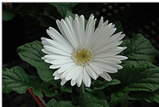
White Gerbera Daisy flowers