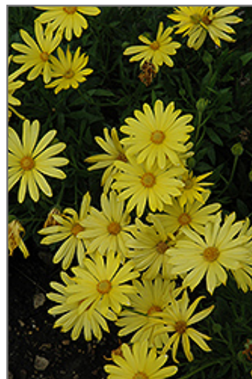
Voltage Yellow African Daisy flowers