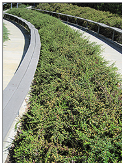
Bearberry Cotoneaster

Bearberry Cotoneaster is recommended for the following landscape applications;