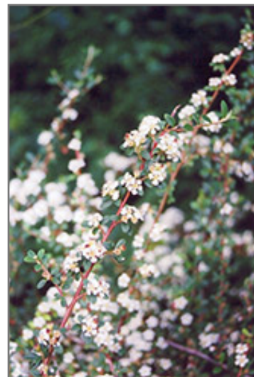
Bearberry Cotoneaster flowers