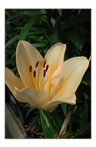
Salmon Classic Lily flowers

An elegant variety bearing large salmon-orange blooms with a gold streak in the midrib; an impressive splash of color, perfect for cutting, containers, and borders