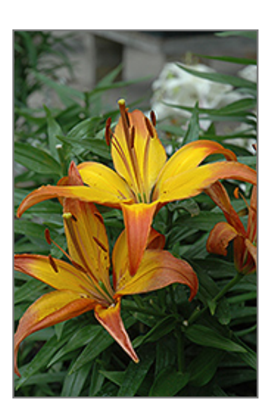
Cancun Lily flowers

A striking hybrid lily producing large upward-facing yellow and orange blooms, crowning sturdy straight stems that are excellent for cutting; this variety is a good choice to create focal interest in areas around shrubbery or border plantings