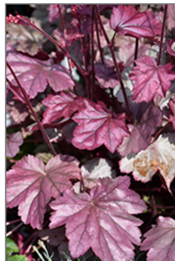
Stainless Steel Coral Bells foliage