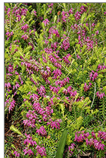
Myretoun Ruby Heath flowers