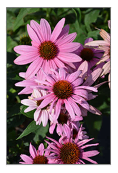
Prairie Splendor Coneflower flowers