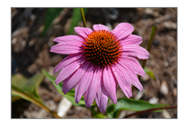
Prairie Splendor Coneflower flowers