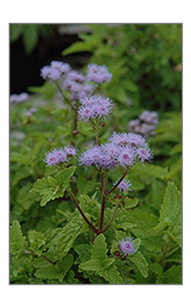
Blue Mistflower flowers

Blue Mistflower features showy blue spider-like flowers at the ends of the stems from mid summer to mid fall. The flowers are excellent for cutting. Its serrated heart-shaped leaves remain green in colour throughout the season.