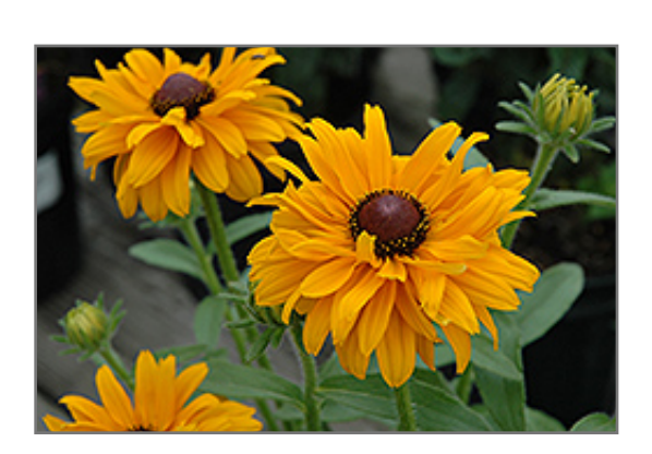
Goldilocks Coneflower flowers

This medium-sized variety produces large semi-double and double deep golden yellow daisies with a dark brown eye; makes an outstanding cut flower; deadhead for re-blooming; drought tolerant once established; wonderful along borders or in containers