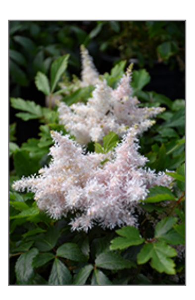
Sugarberry Astilbe flowers

A floriferous dwarf variety producing lovely shell pink blooms above a very compact clump of glossy foliage; perfect in a shady spot with dappled light; prefers moisture so water regularly for abundant flowers and nice foliage; great for mixed containers