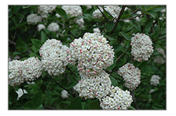
Fragrant Viburnum (tree form) flowers