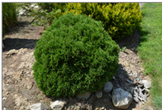
Globosa Rheindiana Arborvitae