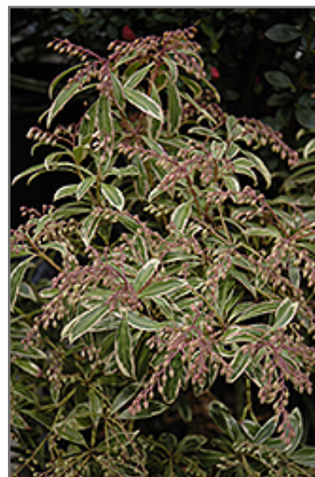
Flaming Silver Japanese Pieris in bloom

Flaming Silver Japanese Pieris is recommended for the following landscape applications;