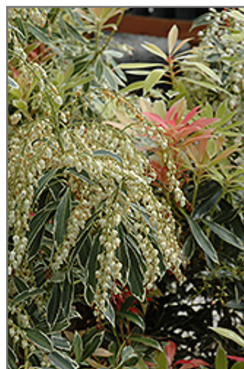
Flaming Silver Japanese Pieris flowers