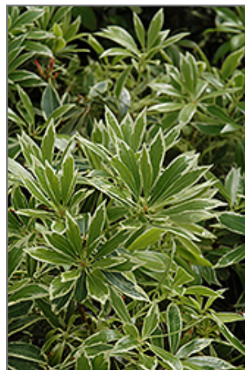
Flaming Silver Japanese Pieris foliage

This shrub does best in full sun to partial shade. It requires an evenly moist well-drained soil for optimal growth, but will die in standing water. It is very fussy about its soil conditions and must have rich, acidic soils to ensure success, and is subject to chlorosis (yellowing) of the foliage in alkaline soils. It is somewhat tolerant of urban pollution, and will benefit from being planted in a relatively sheltered location. Consider applying a thick mulch around the root zone in winter to protect it in exposed locations or colder microclimates. This is a selected variety of a species not originally from North America, and parts of it are known to be toxic to humans and animals, so care should be exercised in planting it around children and pets.