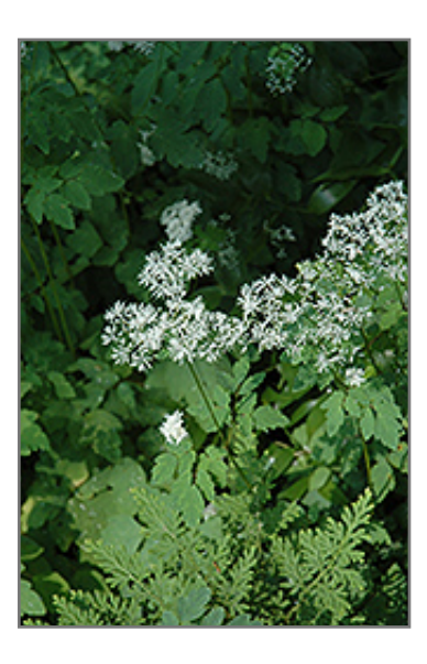
Meadow Rue flowers

This repeat blooming woodland perennial produces clumps of deeply lobed airy leaves which are topped with the daintiest of creamy white flowers; excellent for cutting; may need to stake stems in richer soils; a must for the woodland garden