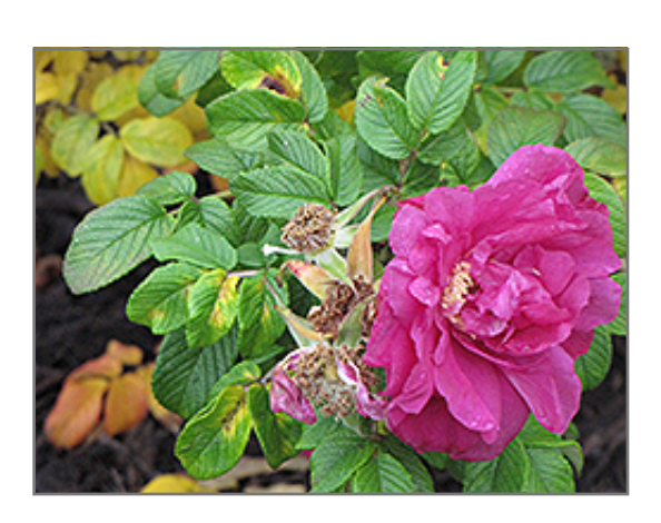
Rubra Wild Rose flowers

A robust and very hardy wild rose featuring stunning electric pink single blooms with a soft yellow center; perfect for the garden, or an informal hedge; these roses need full sun and well-drained soil; very easy to care for