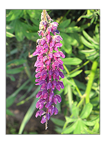
Common Lupine flowers

A stunning variety producing long spikes of eye catching violet and blue flowers; a tremendous visual impact massed in the garden. border plantings or containers