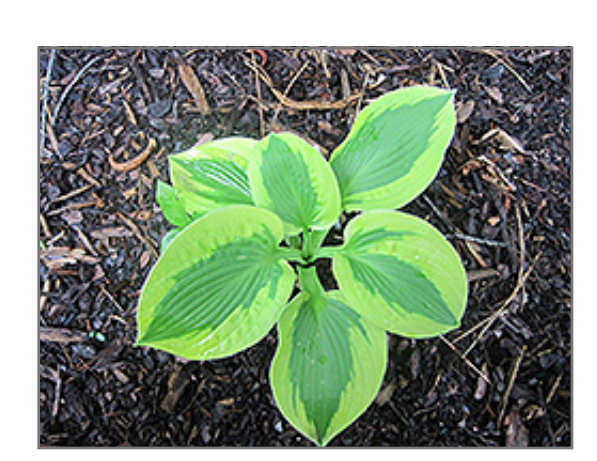
Tropical Storm Hosta