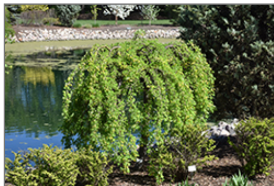
Weeping Peashrub