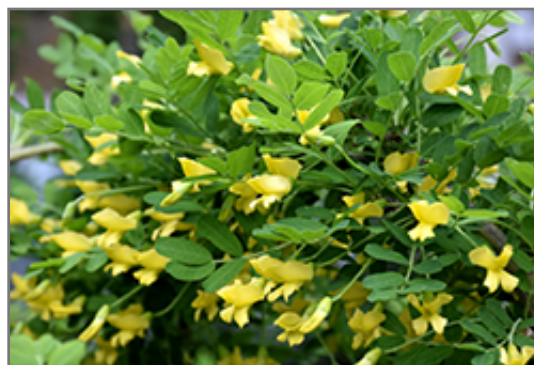
Weeping Peashrub flowers