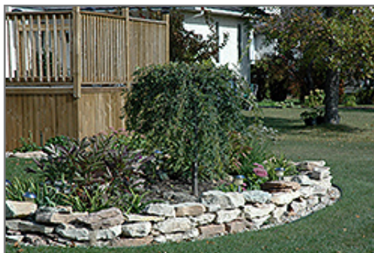
Weeping Peashrub

This shrub does best in full sun to partial shade. It prefers dry to average moisture levels with very well-drained soil, and will often die in standing water. It is considered to be drought-tolerant, and thus makes an ideal choice for xeriscaping or the moisture-conserving landscape. It is not particular as to soil type or pH, and is able to handle environmental salt. It is highly tolerant of urban pollution and will even thrive in inner city environments. This is a selected variety of a species not originally from North America.