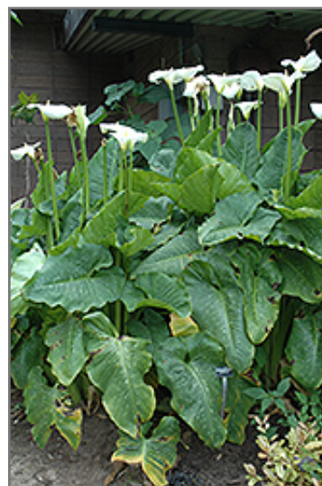
Hercules Calla Lily in bloom