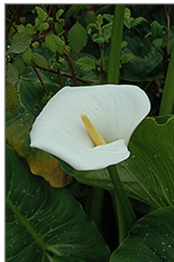
Hercules Calla Lily flowers

Hercules Calla Lily is recommended for the following landscape applications;