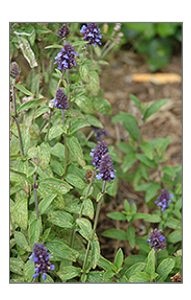
South American Sage flowers

South American Sage features showy spikes of blue flowers with purple calyces rising above the foliage from late winter to early spring. Its fragrant pointy leaves remain dark green in colour throughout the season.